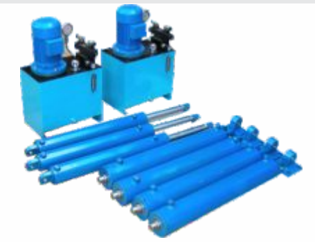
power Pack & Hyd. Cylinder

JK Enterprise Accelerator Of Men's Power