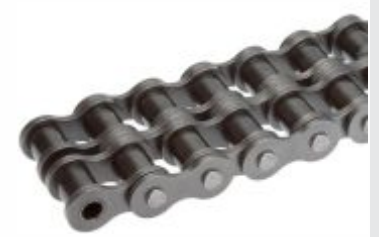
Duplex Twin Chain